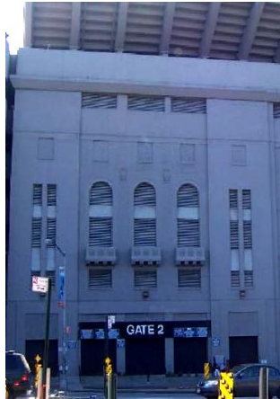
Gate 2: 1976-Current