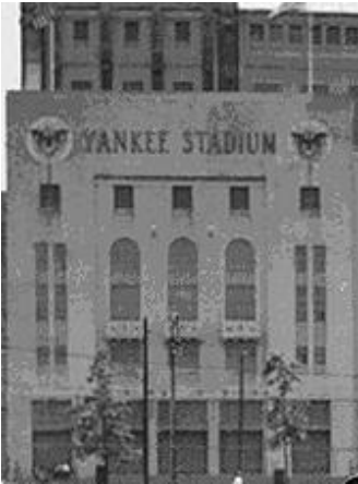
Gate 2: 1928-1973

The exciting reality is that more than 80% of the original 1920's Gate structure remains. Of the stadium's three main entrances, Gate 2 was the only one not significantly altered during the renovation and Gate 2 is the most architecturally significant element remaining from the pre-renovated structure. Please refer to the three photos/renderings below that clearly illustrate this originality.